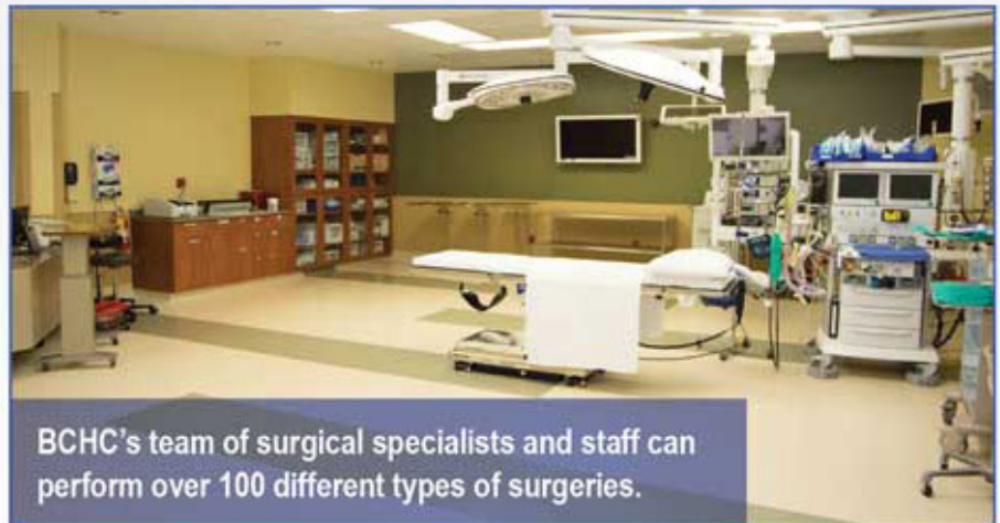
BCHC's team of surgical specialists and staff can perform over 100 different types of surgeries.

For more information about BCHC's surgical specialties, please call 319-332-0999.