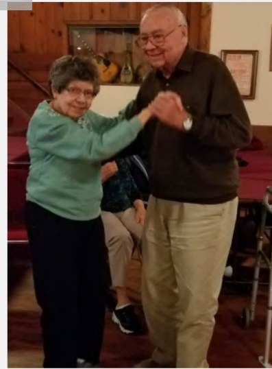
Dancing at the Coliseum in Oelwein