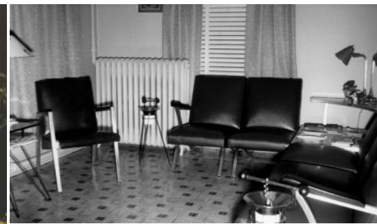
One of the former waiting rooms of Medical Associates, now home to Cedar Valley Hospice.