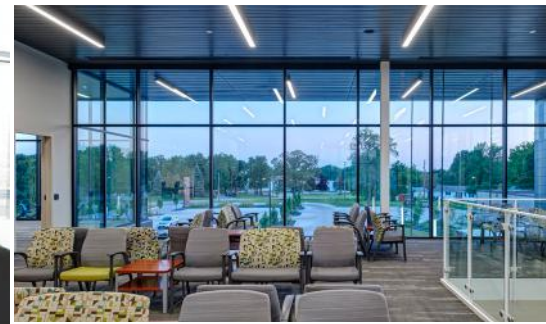
The current Medical Associates waiting room, located on the 2nd floor of the BCHC medical office building.