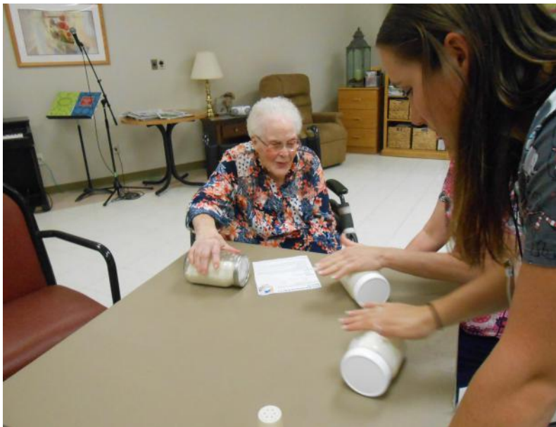
Butter Making and Biscuits