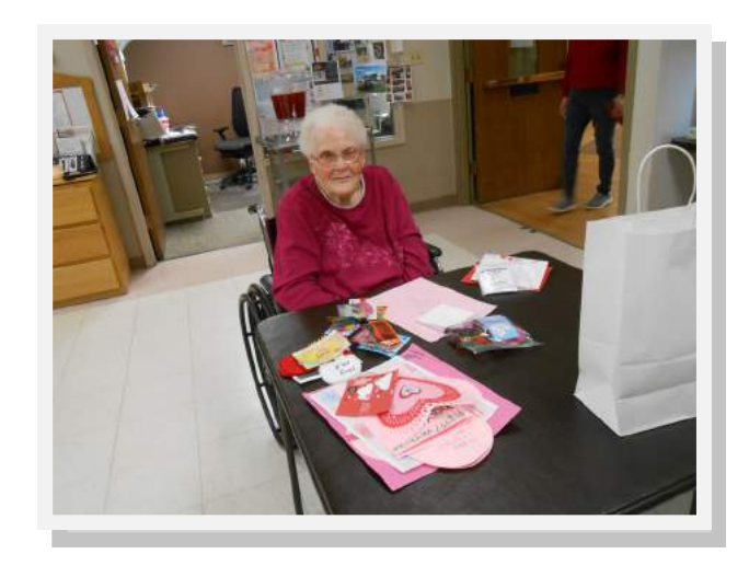
Thanks for the Valentines!