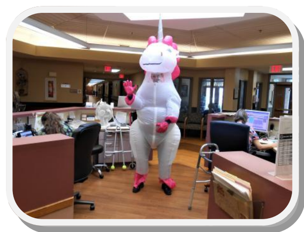
A Unicorn and the Easter Bunny made visits!