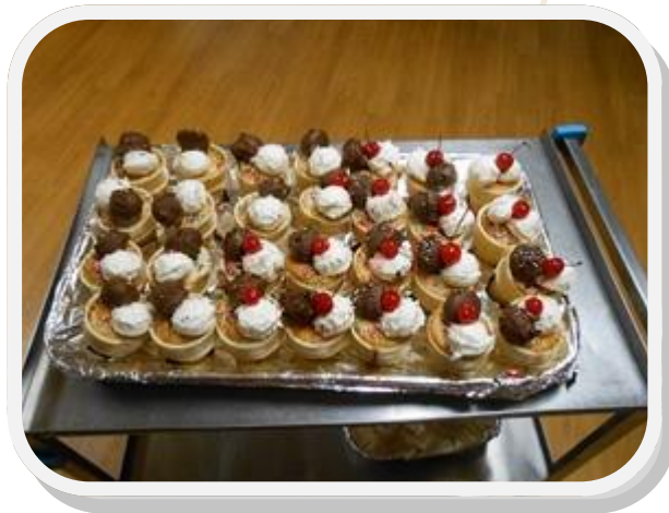
Ice Cream Cone Cupcakes