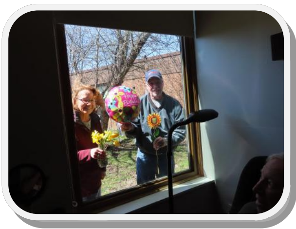
Window Chats are always welcome!