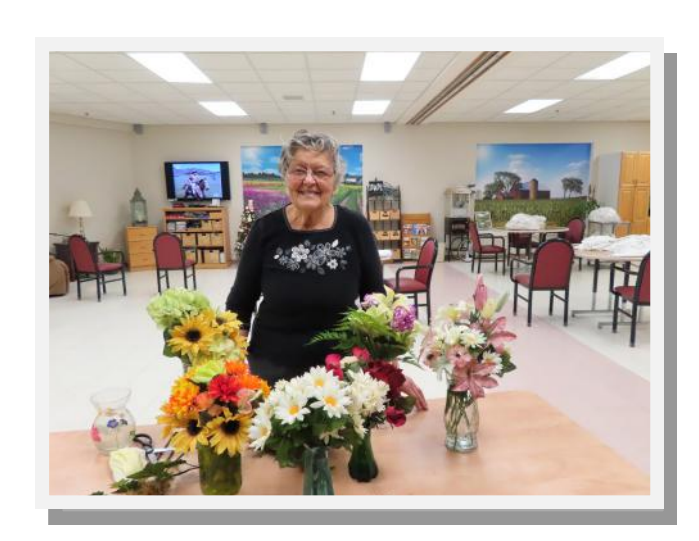
Arranging Flowers to share with others.