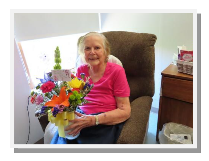
Receiving Flowers from Family!