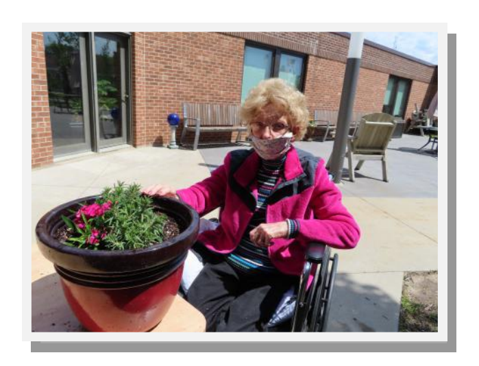
Sending LOVE to our families!