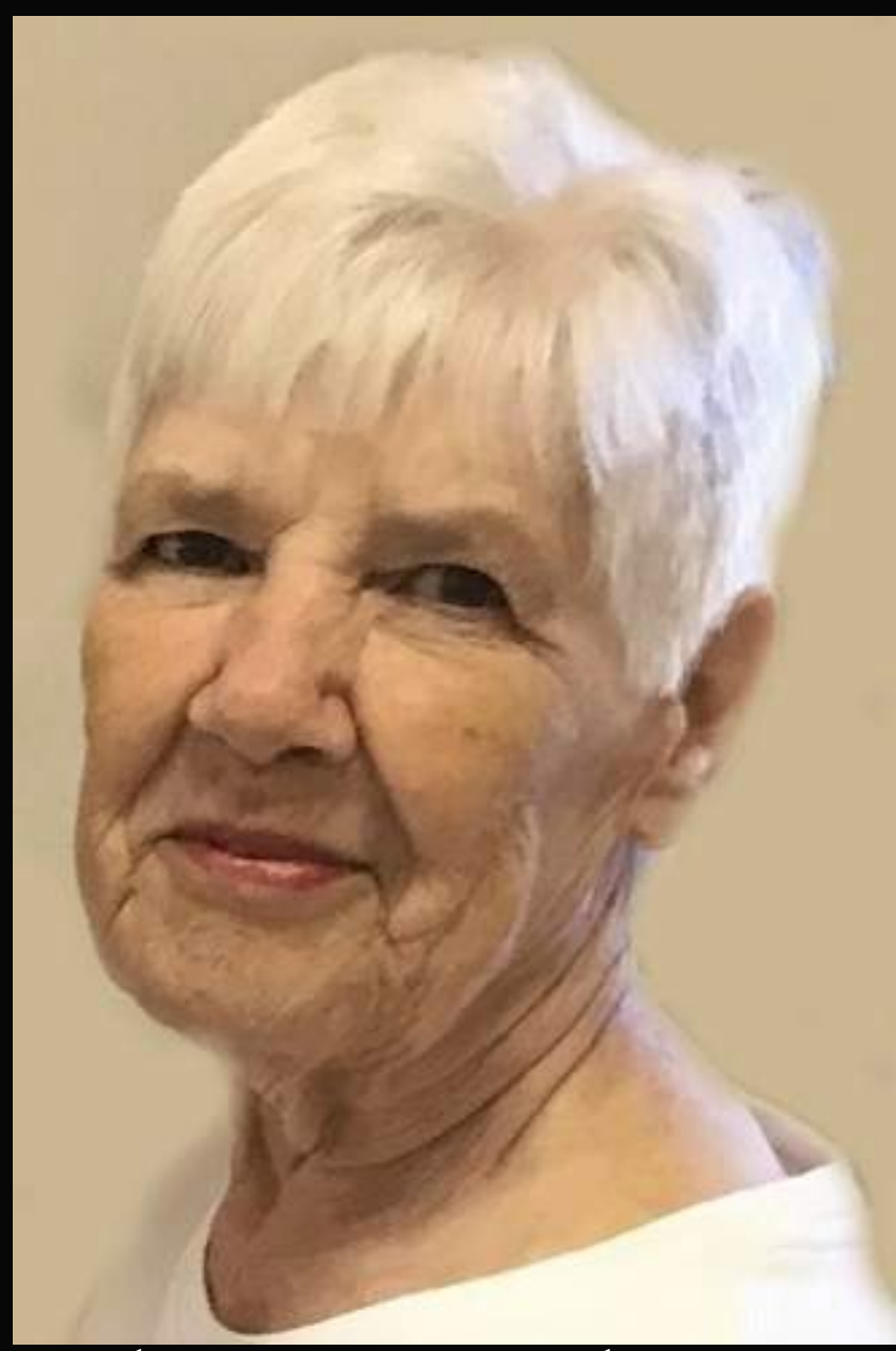
October 11, 1940-November 12, 2022

It's such a special parcel. Please Santa, don't delay. I would love it to be in heaven In time for Christmas day.